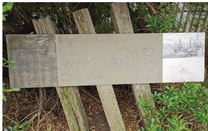
Interpretive signage along Port Heritage Trail

If you'd like to know more about Melbourne's maritime history, Seaworks is a great source of information and home to an impressive collection that tells the story of the long association our city has had with the sea.