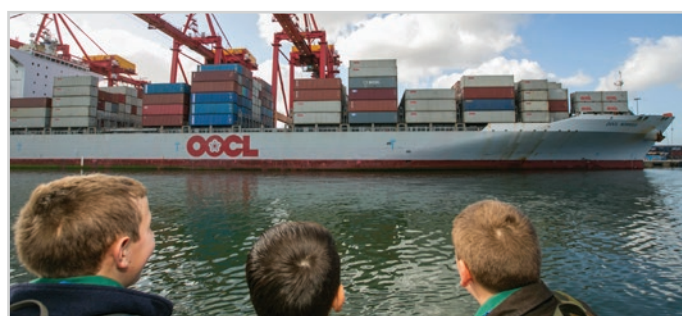
Guided tours of the Port Melbourne freight facilities

We expect the impacts on our neighbours to be minimal, if you have any questions please contact us on the numbers below.