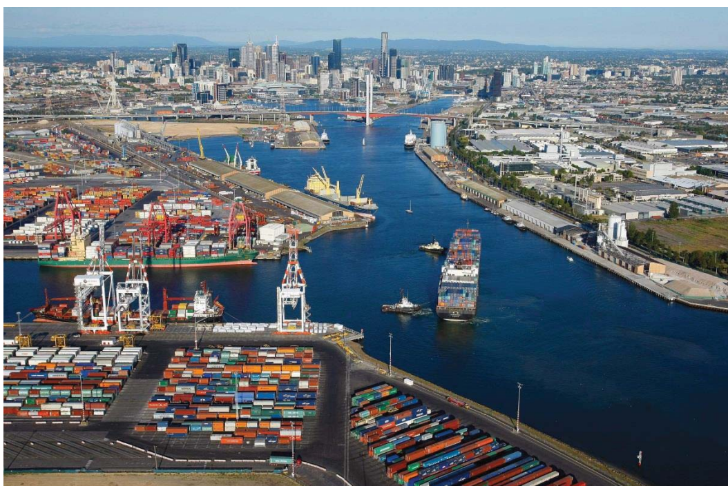
Port of Melbourne